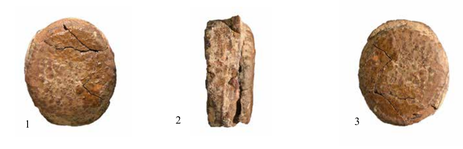
Fig. 3. Scaraboid No. 3.

3. Area B, L212, Reg. No. 2269. Material: Light brown paste, dark brown color. Dimensions: 13.3 × 11.3 × 5.7 mm. Method of Manufacture: Carving. Workmanship: ? Technical Details: Carving from both sides. Preservation: Complete, very eroded. Description: The item was eroded and therefore, its base design was not visible. Typology: Plain back and sides? Date and Archaeological Context: The base's design was hardly visible, and thus, no date